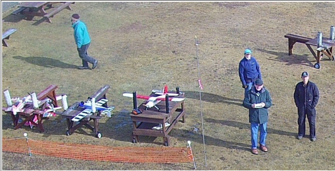
Brave flyers at the KVMA Field. Taken with my Blade Chroma Quad.